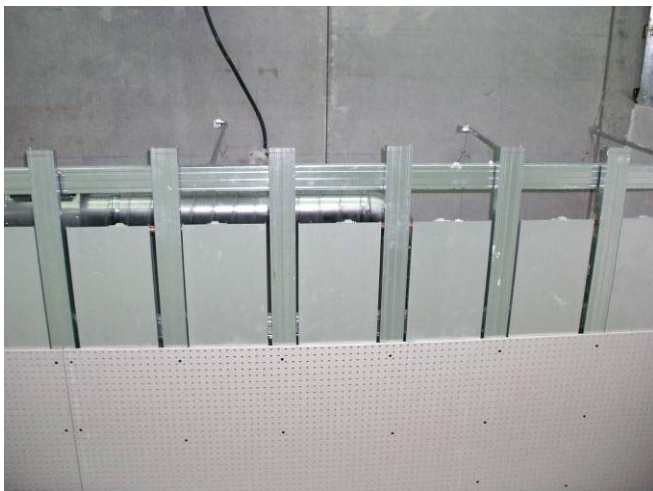
The acclimatised ceiling (still in structural work) serves as a heating or cooling of offices.