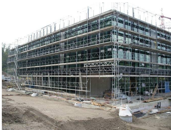
Glas cladding on the „HOME OF FIFA“