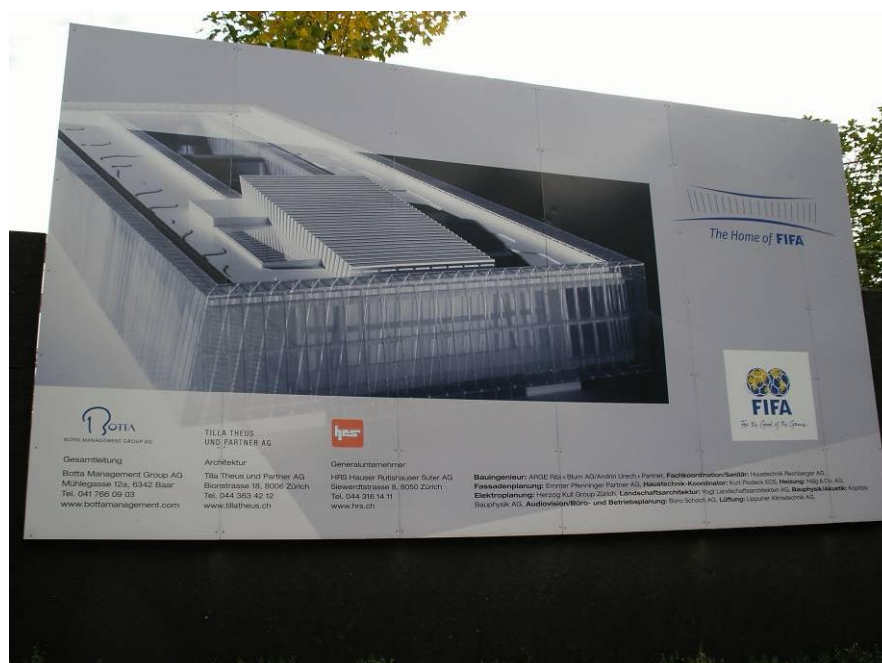
Project „ HOME OF FIFA „