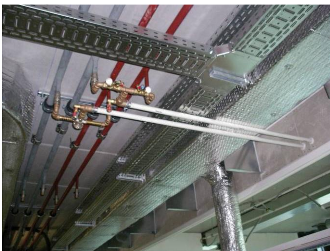
Supply line connected to a heating and cooling system.