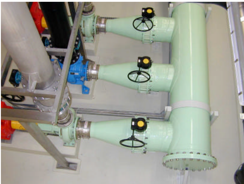
No noise transfer on the joint to the collector