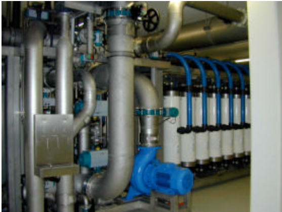
Ultra-filtration module connected by STRAUB-GRIP-L 323.9 mm.