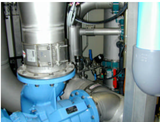
No tension transfer on connections